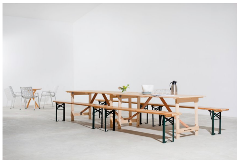
Hay Studio- inside the studio

Hay Studio is situated at Burlorne Tregoose, overlooking the Camel Trail and Camel valley, about 2 miles from Wadebridge. www.haystudiocornwall.com