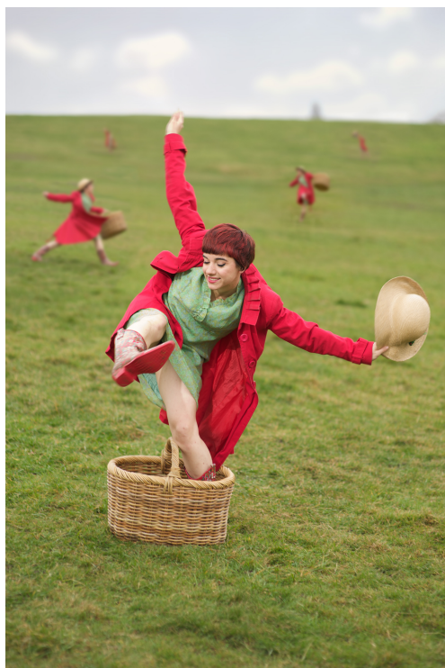
Protein's "The Picnic"