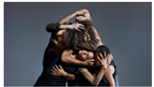
Madhead - NYDC Sat 29 June, 2pm, 7.30pm