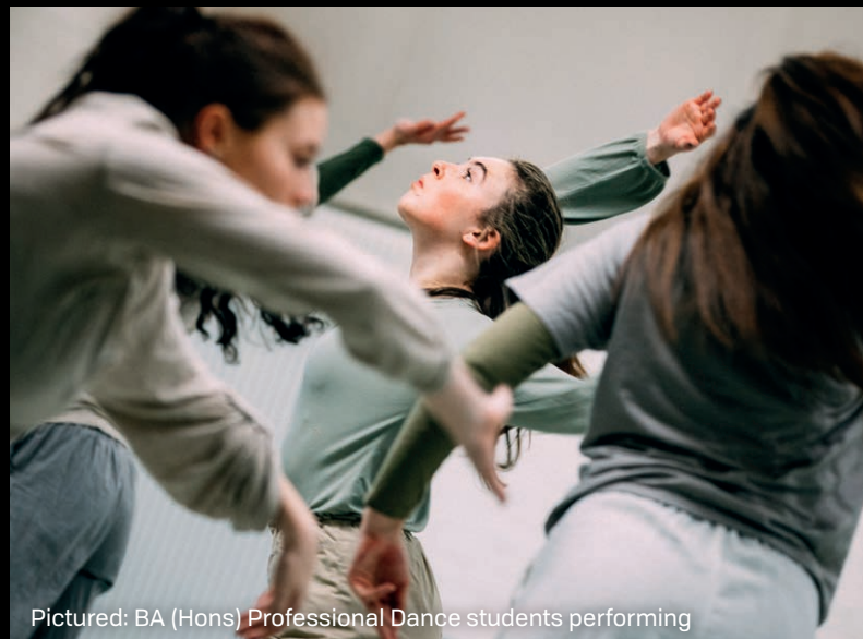
Pictured: BA (Hons) Professional Dance students performing