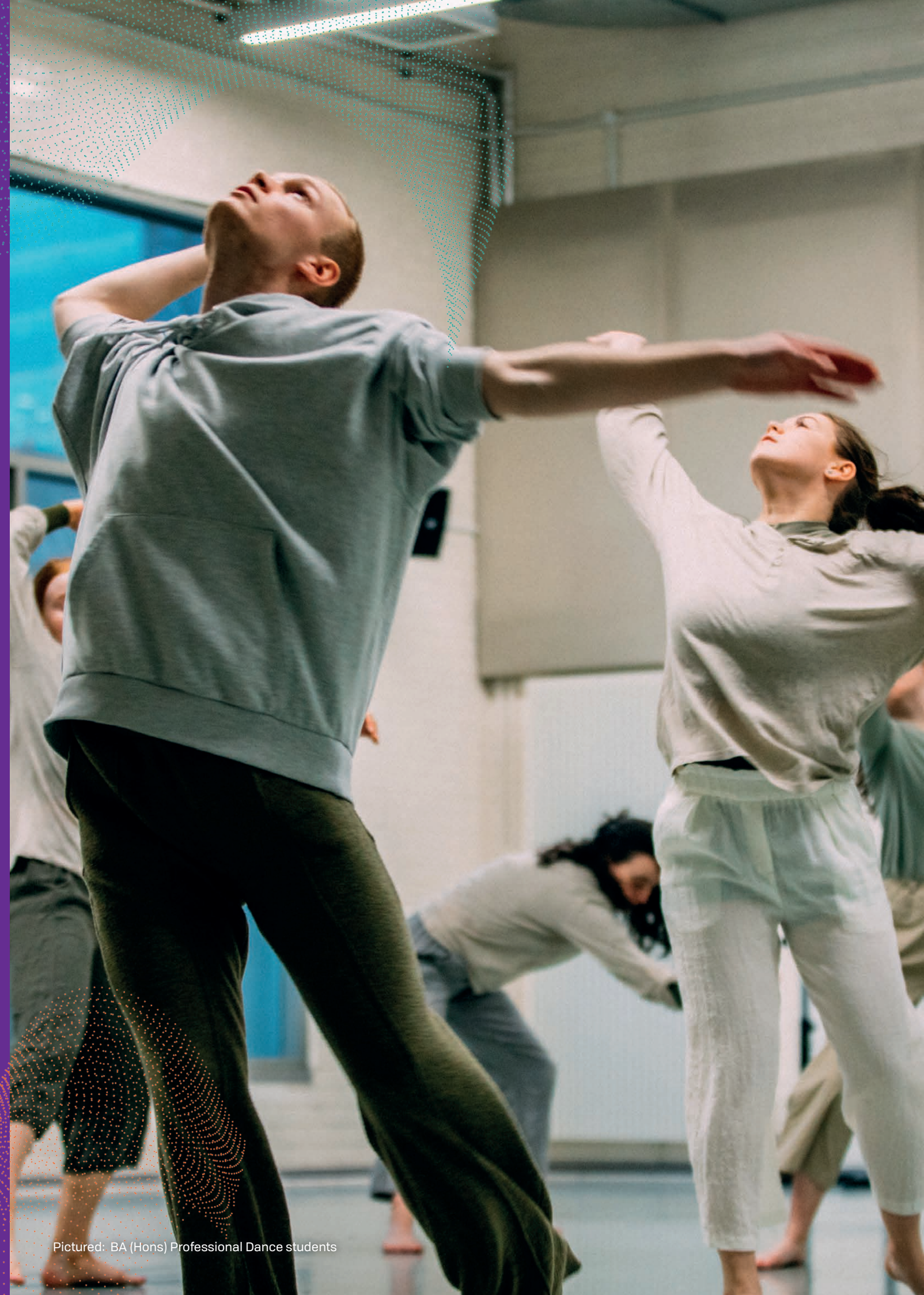
Pictured: BA (Hons) Professional Dance students