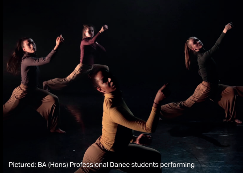
Pictured: BA (Hons) Professional Dance students performing