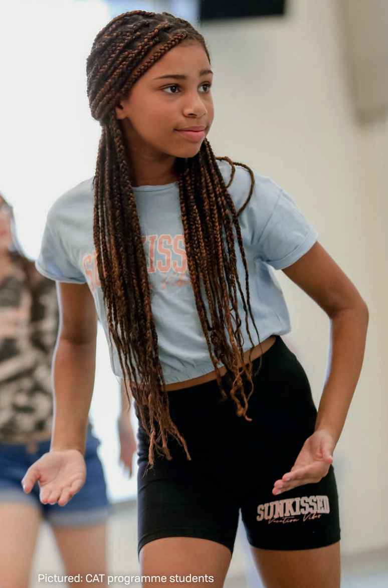
Pictured: CAT programme students