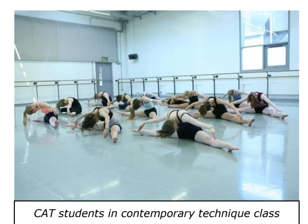
Dance City CAT teachers are all professionals currently working in dance and are experienced experts in technique and choreography. CAT teachers are all dedicated to inspiring young talent, and each have a unique skill set which gives them the ability to help each student reach their full potential. CAT teachers are there to support you through your training, and you should approach them for help with any aspects of the programme you feel they can assist you with.

A typical CAT timetable will include the following classes: