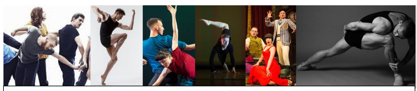
Dance City CAT alumni

During these visits the students attend a mock audition, have the chance to look around the buildings, tour the schools, take part in question and answer sessions with senior staff from each school and meet teaching staff and students. These visits take place during the October half-term week.