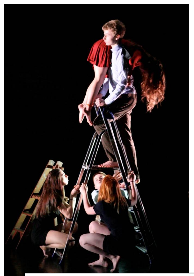
CAT students perform in the Theatre.