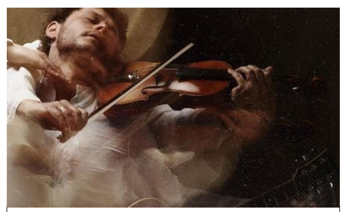
Image: Lo-Giudice Dance company's 'Roma' performed at Dance City in December 2022. CAT students attend a minimum of three live dance performances each academic year

CAT Theatre Visit Policy: If a student has a Theatre Visit ticket booked which they do not attend, and they haven't let us know at least 48 hours in advance of the performance, then they will not be offered a free ticket for the next CAT Theatre Visit.